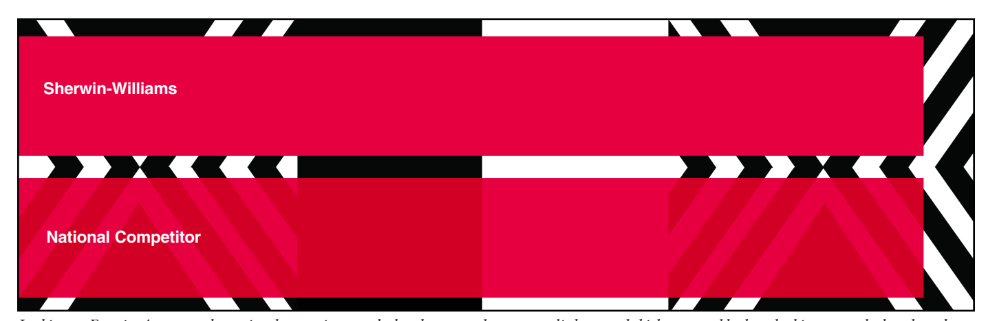
In this test, Exterior Accents and a national competitor matched to the same color were applied at equal thickness over black and white test cards that show the relative hiding power of each coating. The competitors' product is transparent, with the black and white stripes clearly showing through the dried film. The result is undeniable: Exterior Accents hides better.

The high hiding performance means fewer coats, less labor expense and faster job turnover for contractors. And the colorfast performance means customers get the color they want, now and in the future. Contractors can bid jobs with confidence, reduce callbacks and increase referrals. Exterior Accents puts Sherwin-Williams and contractors ahead with maximum hide and protection, and comes with a 25-year durability warranty when used with the Sherwin-Williams ColorPrime® System.